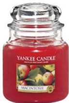
YANKEE CANDLE America's best Loved candle™

We are very excited to partner with YANKEE CANDLE for the NES PTA Fall Fundraiser! NES PTA will receive 40% of profits raised! Catalog orders (information was sent home with children) will be accepted between September 29 th and October 13 th . Online orders will be accepted through January 11 th ! Please check out the online catalog to get a head start on your holiday shopping! www.yankeecandlefundraising.com/ Group Number 999972884